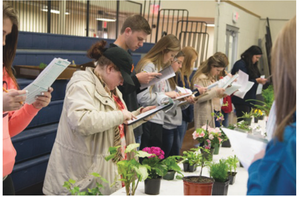
Students compete in the floriculture contest during Northeastern A&M’s Aggie Days. The photo taken pre-COVID.

Registration and the 2021 Aggie Days letter can be found at: https://www.judgingcard.com/Registration/Info.aspx?ID=12220