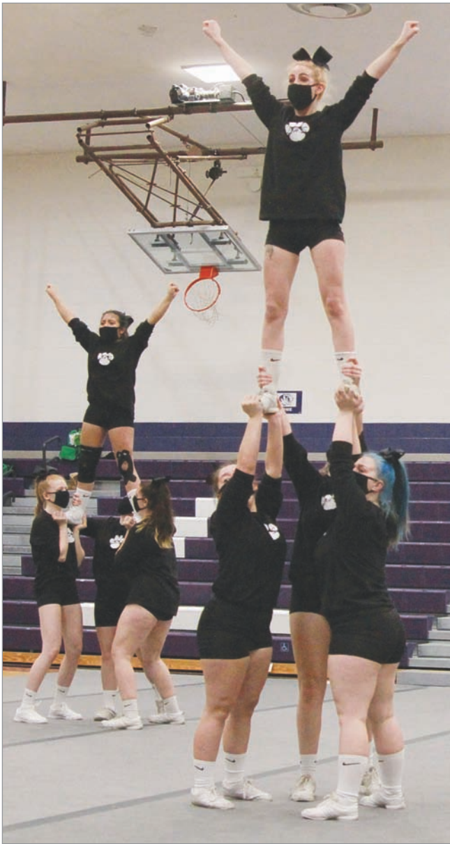
The Lawrence competitive cheer team hosted two area schools last week, Berrien Springs and South Haven for the second BCS conference meet. The Tigers ended the opening round with a score of 173, the second round with a score of 134.4, and third round with a score of 183.8 for an overall final total of 491.2, and a second place finish in the meet. The Tigers will face Berrien Springs again on March 10 when they travel to the home of the Shamrocks.