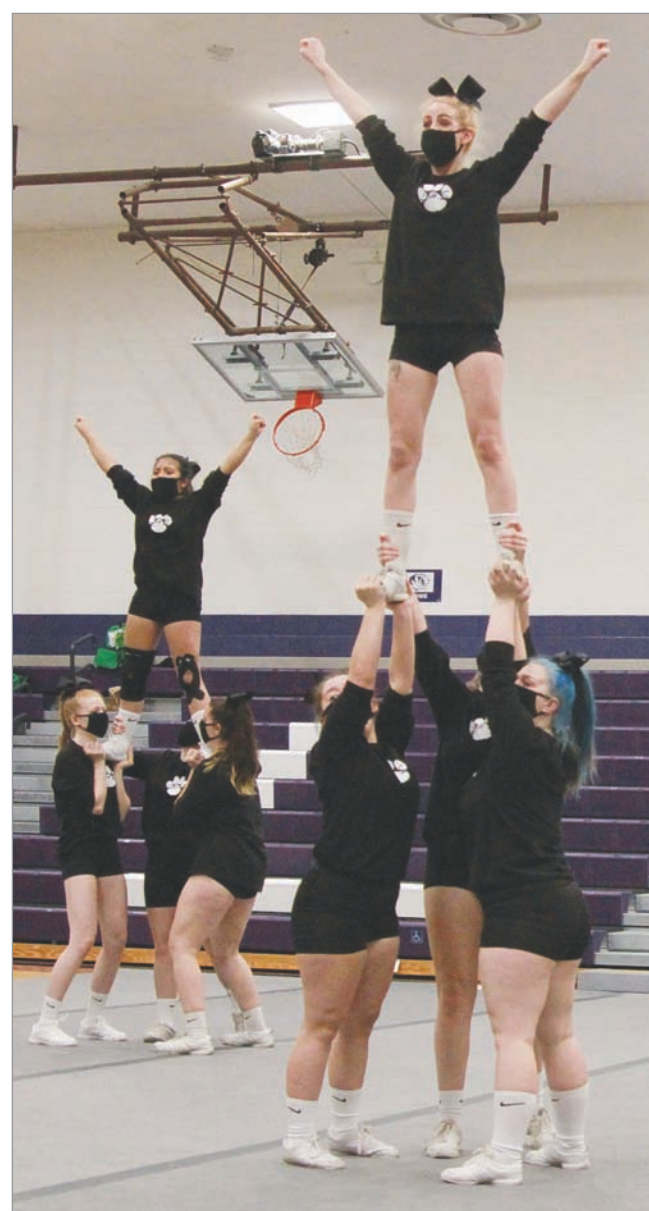
The Lawrence competitive cheer team hosted two area schools last week, Berrien Springs and South Haven for the second BCS conference meet. The Tigers ended the opening round with a score of 173, the second round with a score of 134.4, and third round with a score of 183.8 for an overall final total of 491.2, and a second place finish in the meet. The Tigers will face Berrien Springs again on March 10 when they travel to the home of the Shamrocks.