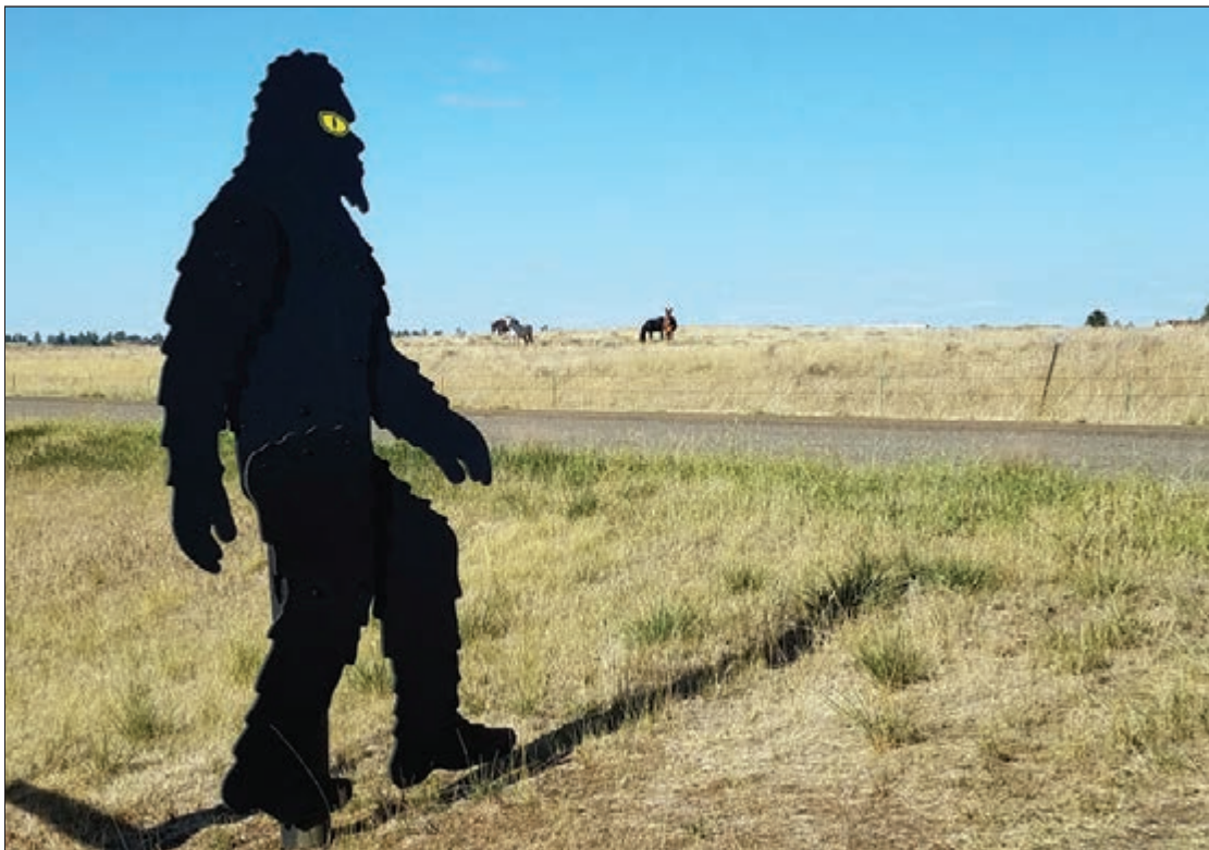
Bigfoot (also known as Sasquatch) has been sighted near Little Porcupine Creek Road in rural Rosebud County. The mule and horses in the pasture weren't the only ones checking out the stealthy figure!