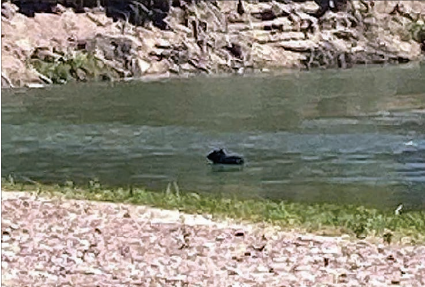
The Rosebud County Sheriff's Office posted this photo of a black bear escaping the fires around Ashland last week, and cooling off at the same time on its Facebook page.