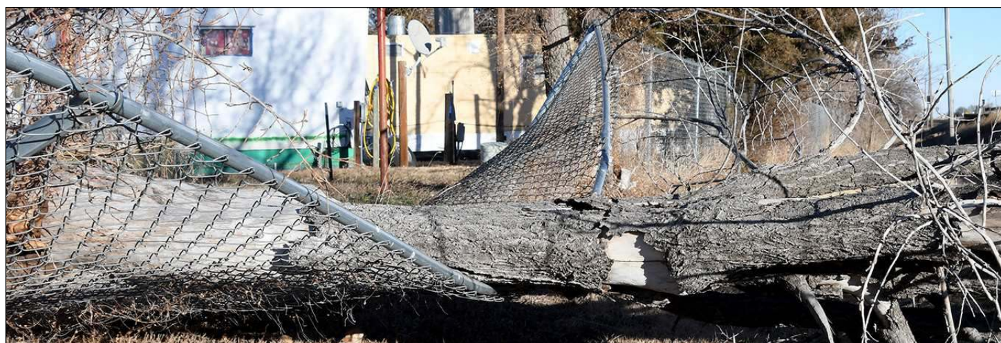
THE HOLYOKE ENTERPRISE | JOHNSON PUBLICATIONS