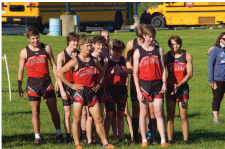
East Central Boys Cross Country