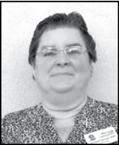
Licensed Practical Nurse

Mederi CAREtenders 6719 Crill Ave., Palatka, FL 32177 386-325-3555