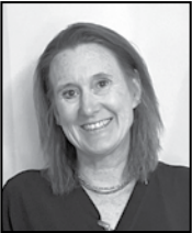
Physical Therapist Assistant

Mederi CAREtenders 6719 Crill Ave., Palatka, FL 32177 386-325-3555