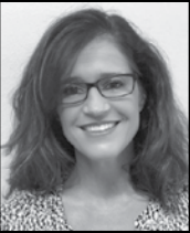
Physical Therapist Assistant