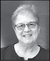
License Registered Nurse

Mederi CAREtenders 6719 Crill Ave., Palatka, FL 32177 386-325-3555