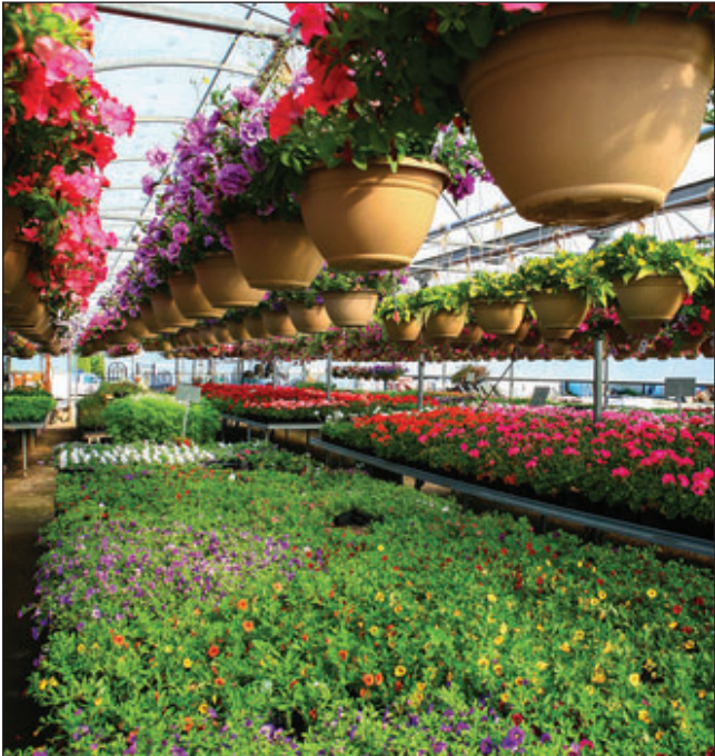
Local garden centers can be excellent resources for gardeners planting perennial gardens for the first time.