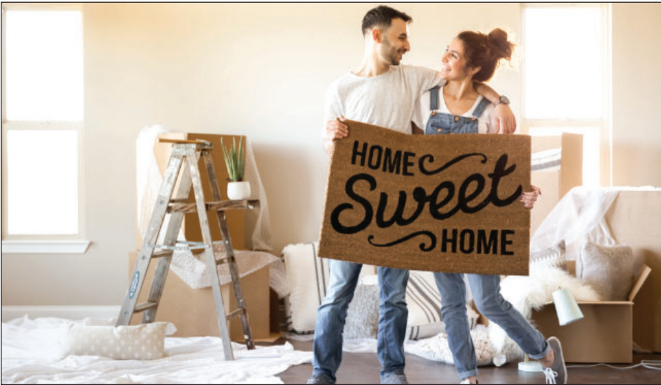
Brohn Homes provides superior designs and quality craftsmanship

“Since 2002, Brohn Homes has been building in the most sought-after areas in Central Texas, with a steadfast commitment to provide superior designs, quality craftsmanship, and unparalleled value. Whether it’s your first home or an exquisite luxury home on acreage, Brohn Homes has something to meet any future home buyer’s needs by making home ownership attainable for almost any buyer.”