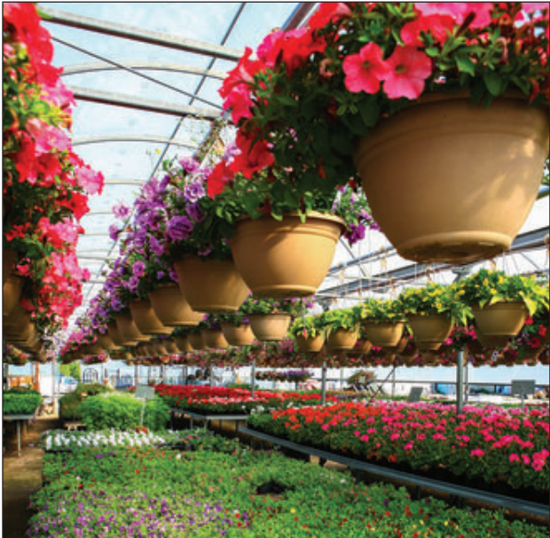
Local garden centers can be excellent resources for gardeners planting perennial gardens for the first time.

are likely to haunt you year after year as well. Factors like space and location must be considered before planting. Many gardeners utilize garden planning applications like GrowVeg to make the process of planning a garden simpler and more organized. Such applications can be especially useful for novices. 2. Consider aesthetics. Gardens can be awe-inspiring, especially when gardeners consider aesthetics prior to planting. The