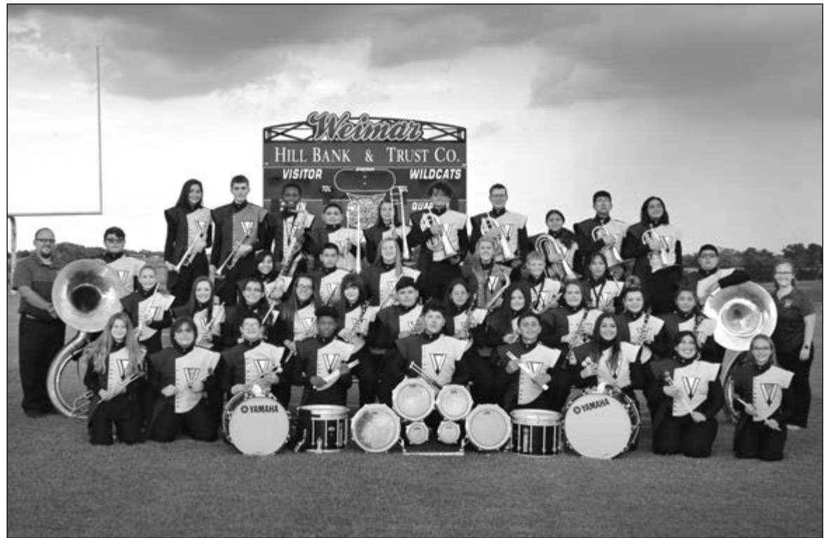
The 2020-2021 Weimar High School Band.