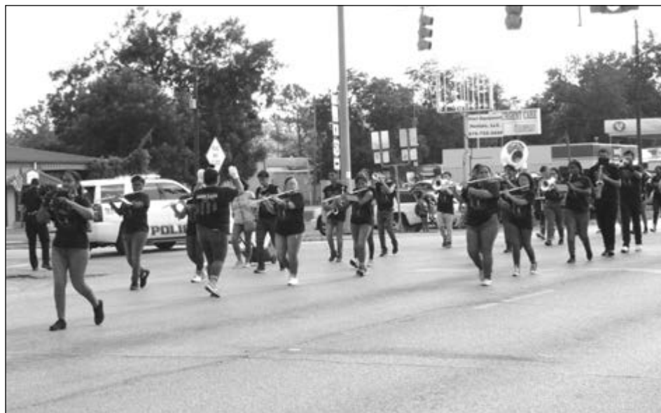
The Raider Band performed at the 2019 Colorado County Fair parade last year.