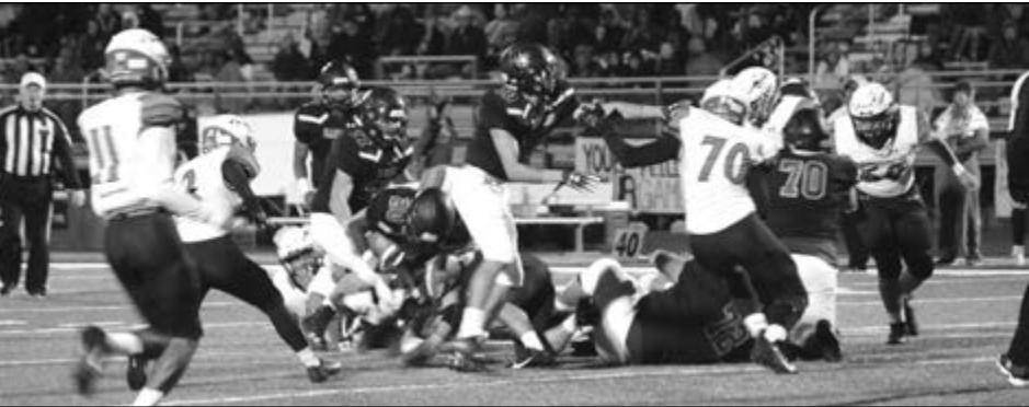
The Rice Raiders in action last season.