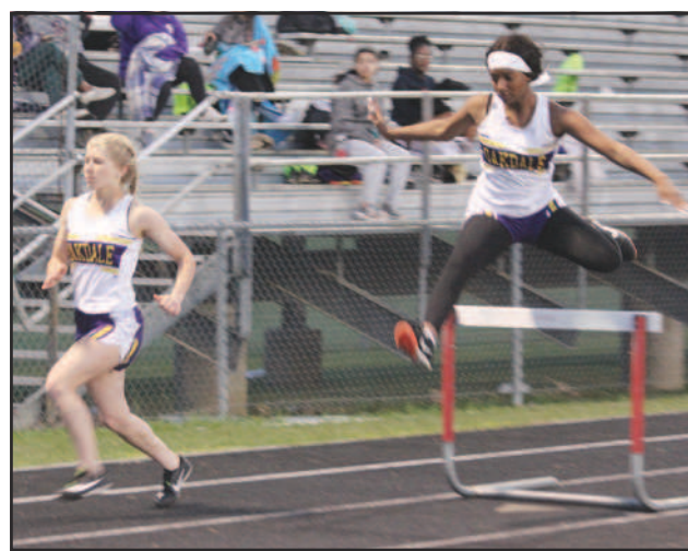
Page 3: Oakdale girls compete in the hurdles during the Allen Parish Track Meet.