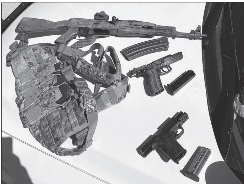
Two handguns and an AK-47 were discovered inside a vehicle when Crowley Police responded to a man overdosing in the parking lot of a local restaurant late Saturday night. The rifle, loaded with the safety off, was discovered in the lap of the man's 10-year-old son. (Photo submitted)

The children were taken to a local hospital, according to Broussard, who added that he expects child services will be called to take custody of them.